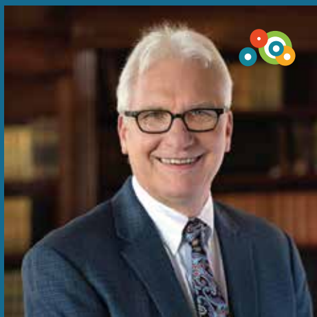
Facilitating Students' Motivation and Wellness: Research and Strategies from Self-determination Theory Prof. Richard Ryan - VIC/WA