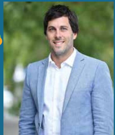
I'm Safe, I'm Here, I'm Listening: a Practical Guide to Effective Classroom Communication Ben Sacco ALL STATES