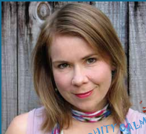
The Power of Vulnerability Dr A.J. Betts - ALL STATES